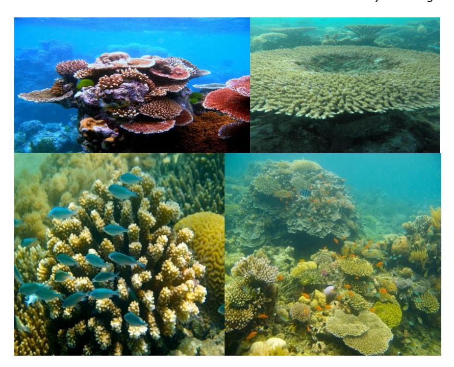
Figure 1: Corals of various ecosystems.

Percentage of coral cover is the percentage of area covered by coral growth. It is obtained by measuring the coral colony intercepted by the transect line. Coral reef health is an important indicator for the assessment of sustainable protected coral reef management conservation. The coral reef healthy indicator will include some community properties namely coral cover and life forms. Coral cover information is a basic data in sustainable marine protected area management. A healthier coral can be а spawning, feeding, and good nursery ground, thus creating new fishing grounds which indirectly has an impact on improving fish the community economy from catches.