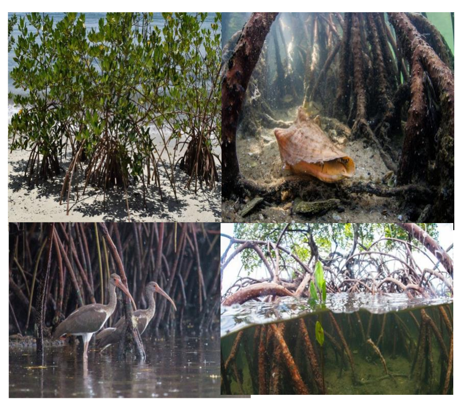
Figure 2 : Mangroves with complex rooting system: Source MBREMP and internet.

environment (d) Mangrove forests are appreciated in capturing massive amounts of carbon dioxide emissions and other greenhouse gases from the atmosphere, and then trap and store them in their carbon-rich flooded soils for years. This buried carbon is known as "blue carbon" because it is stored underwater in coastal ecosystems like mangrove forests, seagrass beds and salt marshes. (e) Mangrove forests also provides habitat and refuge to wildlife such as birds, fish, invertebrates, mammals and plants. (f) Mangroves also are known as important spawning and nursery territory for juvenile marine species including shrimp, crabs, and many sport and commercial fish species (g) Mangrove forests provide nature experiences for people such as birding, fishing, snorkeling, kayaking, paddle boarding, and the therapeutic calm and relaxation that comes from enjoying peaceful time in nature. Figure 2 shows some pictures of mangroves (i) the tree itself (ii) the dense root system and (iii) the illustration of roles it plays by being the feeding and habitat of vertebrates and invertebrates.