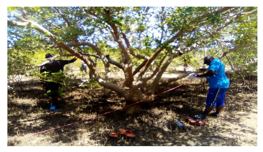
PHOTO: Establishment of transect during mangrove monitoring in TACAMP.